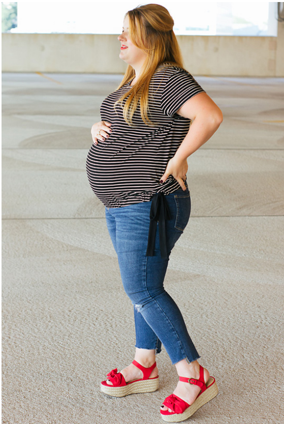
MEGMADE Sewing Fabric | Harts Fabric